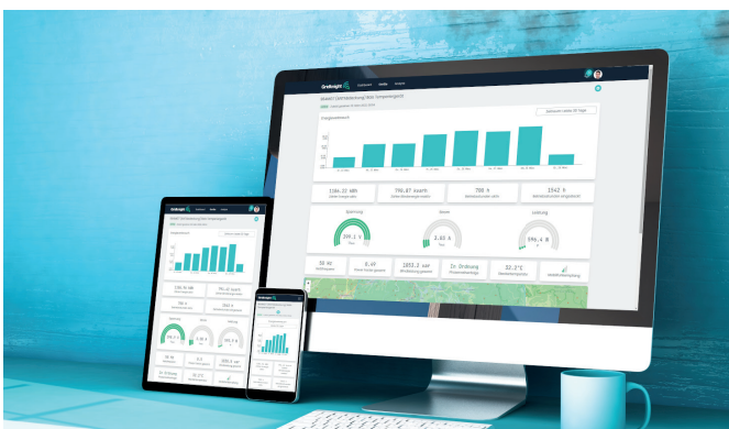
Administer your users, devices, energy tariffs, alerts and many more through a central web application.

The measuring devices connect directly to the internet via their cellular connection. Thanks to modern cellular technologies this is possible even under poor radio conditions like in basements. You do not need to worry about anything - BALS-CONNECT takes care of the cellular connection and the included SIM card.