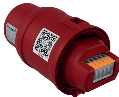
The screwless spring terminals can be operated manually, there is no need for additional tools.